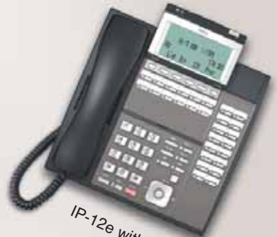
IP-12e with DLS