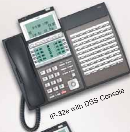
IP-32e with DSS Console

The UX5000 offers an impressive array of high-performance IP and digital proprietary terminals. Choose from display and non-display, handsfree or full-duplex handsfree models. Select models offer backlit display and illuminated dial pad. All features not available on all models. Description depicts an enhanced IP Terminal.