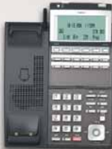
IP-12e with Bluetooth Cordless Handset